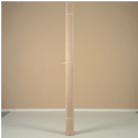
Step 3: Hold together with nylon ties provided until glue dries.