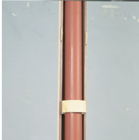
Step 2: Attach spacers and glue in the biscuits provided.