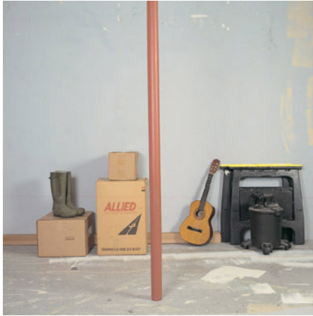
Step 1: Begin

Hide ugly basement poles with our pole covers and transform any lolly column into a decorative element!